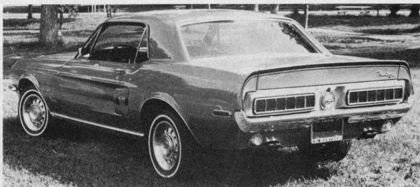
From the rear this Pony looks like a Shelby, and it has the power to act like one, too.

So there you have it. A Mustang that is rare, powerful, and beautiful all at the same time. However, with only five of these cars in existence, if you've fallen for this High Country Special you may be in for a lifetime of unrequited love. M