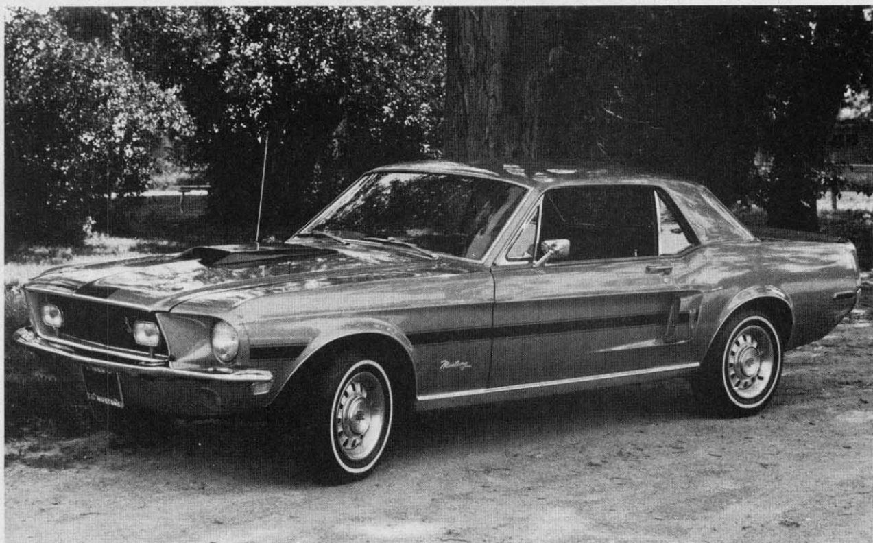
At rest, this '68 coupe looks pretty docile, but looks can be deceiving. The car features GT-type factory wheels with chrome GT caps and beauty rings. It's loaded with factory options in addition to the Cobra Jet engine, and has power steering, power disc brakes, nine-inch rearend with 3.50 gears, remote mirror, and console.