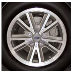
16" Painted Aluminum Wheel w/Bright Machined Face w/Chrome Spinner Std. on V6 Premium & Opt. on V6 Deluxe (941)