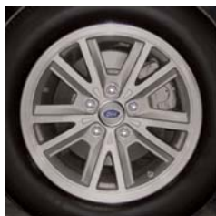
16" Painted Aluminum Wheel w/Bright Machined Face Std. on V6 Deluxe (94B)

Optional Axle Ratio = 3.55 Limited Slip GT Manual Transmission Only (455)