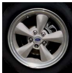
17" Premium Painted Cast Aluminum Wheel Std. on GT Deluxe & Premium (64F)