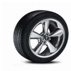
18" Polished Aluminum Wheel w/Small Tri-bar Pony Center Cap Opt. on GT (64W) Included in Cal Special Package (54C)