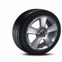
18" Premium Aluminum Wheel Opt. on GT (64E)