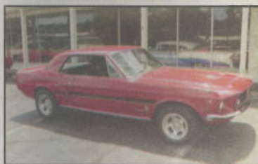
1965 FORD MUSTANG CALIFORNIA SPECIAL

1965 Ford Mustang California Special Clean California built car, documented California Special, beautiful Ford bright red paint. 248-620-3355