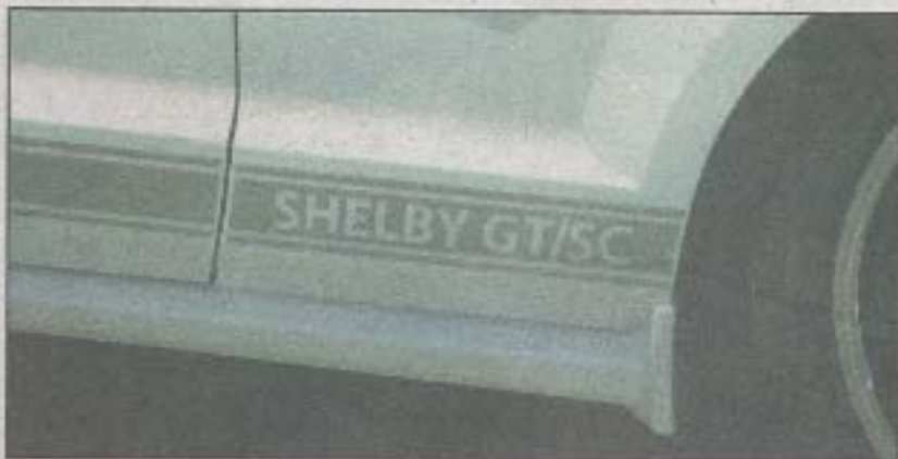
Shelby changes the lower body side stripes on the Shelby GT to the GT/SC whenever their Mod Shop installs a supercharger.