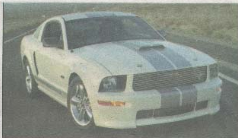
The Shelby GT is the volume Mustang in the line-up. Still, production is small at 6,000 units for '07.

Pre-title Shelby's, thus far, are the Shelby GT, the GT-500, and the new GT-500 KR for 2008. Shelby calls them "pre-title" because they are sold through Ford dealers. The GT-500 came out in '07. Shelby