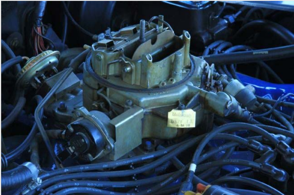
This is the 715-cfm 4300D spread bore carburetor for the Boss 351, 351C-4V High Output, and the 351C-4V Cobra Jet. This is the 4300D on a 1973 351C-4V Cobra Jet. The 4300D is very hard to find because they didn't build many to begin with and a lot of them were thrown away. This 351C is also fitted with EGR (exhaust gas recirculation) and electric choke.